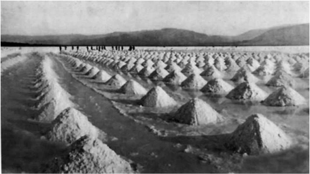
SALT, PILED BY WORKERS USING RAKES AND SHOVELS, READY FOR PICKUP BY WINCH-DRAWN WAGON FOR LOADING ON THE TRAM.