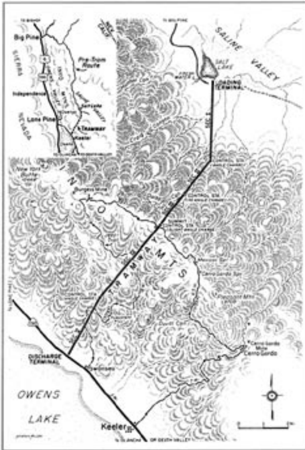
Map by Nelson Allen / Desert Magazine, Aug. 1919

It was estimated that the tramway, which would be the steepest in the United States, would reduce transportation costs of the salt from $20 per ton to $4 per ton.