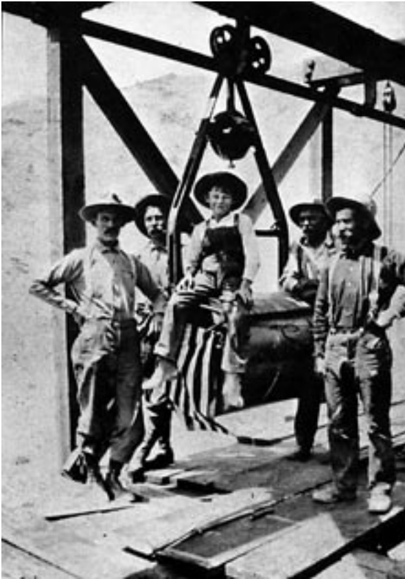
THE FIRST SUCCESSFUL DELIVERY BY THE TRAMWAY WAS A CAUSE FOR GREAT CELEBRATION IN THE LOCAL COMMUNITY.

Final installation was finished in the spring of 1913 and a preliminary test was scheduled for June 10, 1913, but electrical connections from the then new Cottonwood Canyon power station on the Los Angeles Department of Power and Water aqueduct were not completed in time for the test run to take place as scheduled. Finally the first salt was delivered over the formerly impassable Inyo Mountains on July 2, 1913. The first successful delivery by the tramway was a cause for great celebration in the local community.