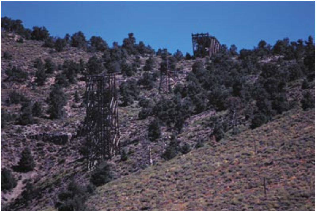
TOWERS ALONG THE RUINS OF THE WEST SIDE OF THE SALT TRAM NEAR THE SUPPLY CAMP AS SEEN IN 2005.