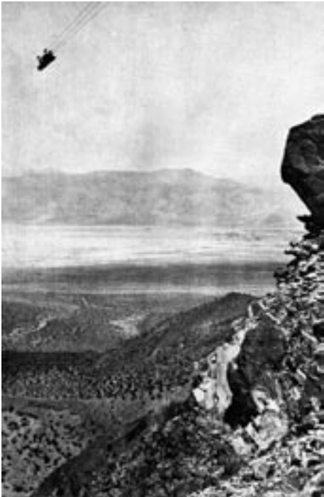
IN PLACES THE CARS WERE SUSPENDED HUNDREDS OF FEET IN THE AIR.

Different designs were tried for two years, and finally, in 1915, the Trenton Iron Works came up with a grip capable of holding the heaviest bucket, plus one man.