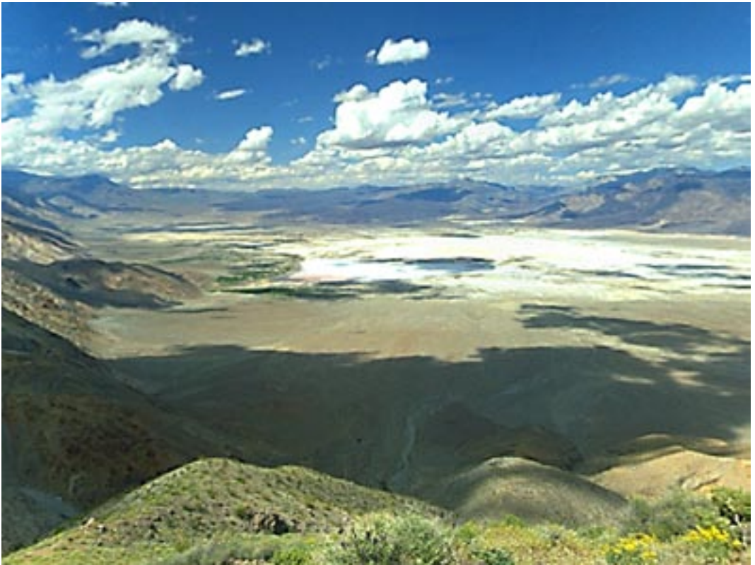
THIS PHOTO WAS TAKEN DURING THE SPRING OF 1998'S ONCE-IN-A-LIFETIME WILDFLOWER DISPLAY. QUICKTIME MOVIE © PAUL FRETHEIM. CLICK IN IMAGE TO PAN OR ZOOM.