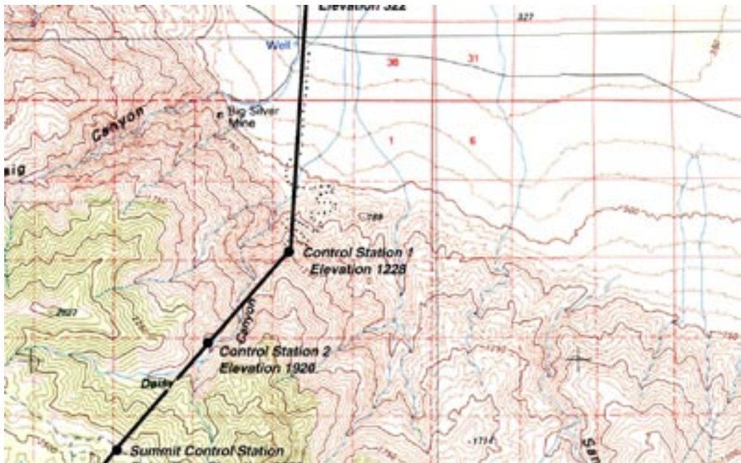
MAP OF TRAMWAY FROM SALINE SALT FLATS TO SUMMIT CONTROL STATION. DOTTED LINE INDICATES HIKING ROUTE TO CONTROL STATION 1.

[FROM USGS 1:100000 SERIES TOPO MAPS. CONTOUR INTERVAL 80 METERS.]