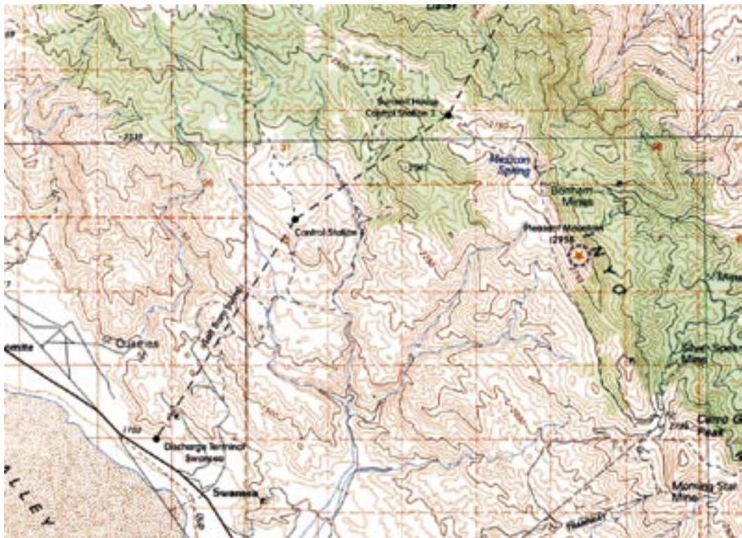
MAP OF TRAMWAY FROM SWANSEA TO SUMMIT CONTROL STATION. FROM USGS 1:100000 SERIES TOPO MAPS. CONTOUR INTERVAL 80 METERS.